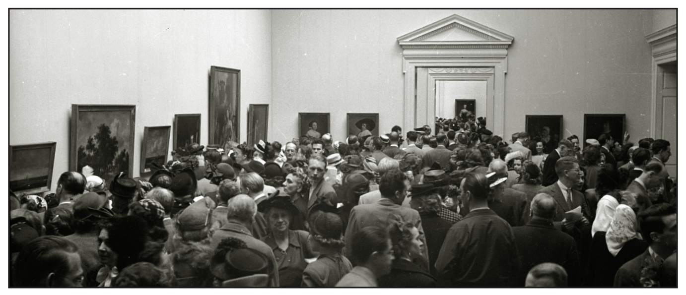
Crowds attending the exhibition, Paintings from the Berlin Museums , at the National Gallery of Art, March 17-April 23, 1948.

German/American Provenance Research Exchange Program for Museum Professionals Deutsch-Amerikanisches Austauschprogramm zur Provenienzforschung für Museen